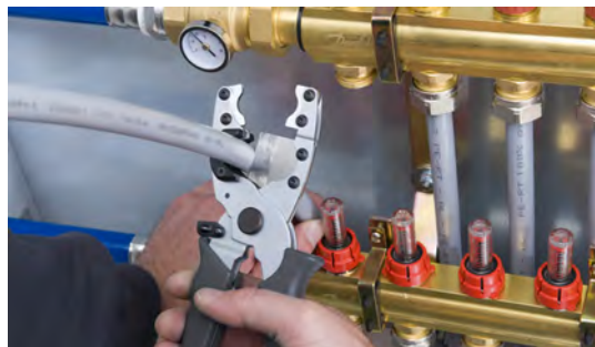
Fig. 1: Before connecting the heating circuit to manifold cleanly cut off FH composite pipe in the correct length.