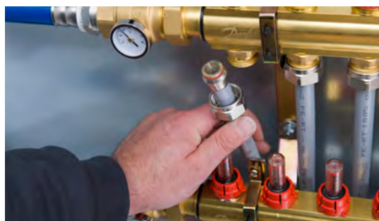
Fig. 3: Slip compression fitting nut over FH composite pipe and push down fitting insert (Eurocone) until it meets end stops.