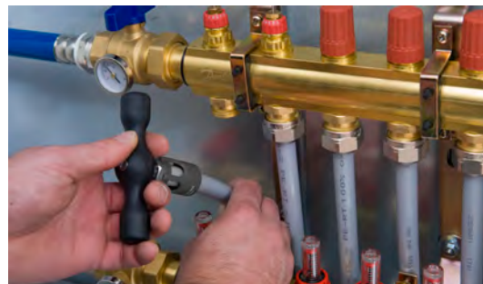
Fig. 2: Centre pipe and bevel with bevelling tool - 2 mm all round bevel on inner pipe.