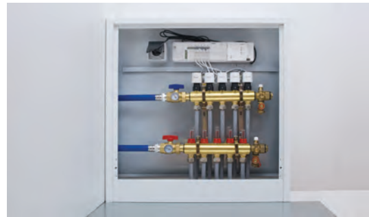
Fig. 10: Finally, fit cabinet door.