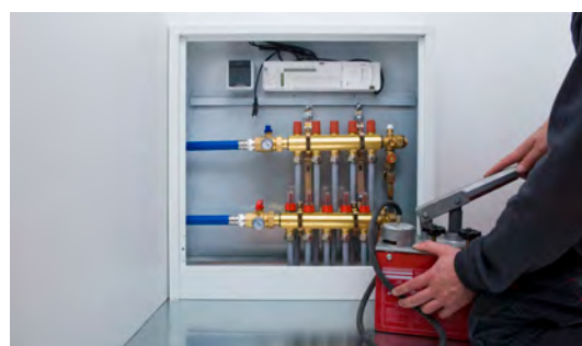
Fig. 6: Label the individual heating circuits. Carry out pressure test in accordance with the pressure test protocol.