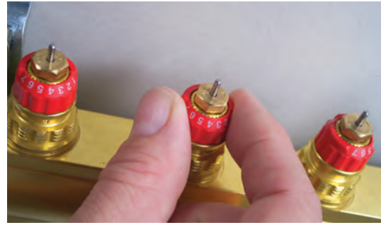
Fig. 8: Preset manifold valve for each heating circuit according to calculations and manifold data sheet.