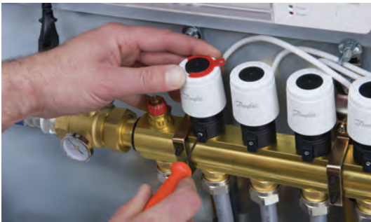
Fig. 9: Fix actuator to valve with a 2 mm Allen key and connect actuator and room thermostats via wiring centre or master controller.