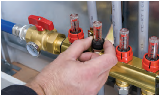
Fig. 7: Open ball valves and all flow meters completely.