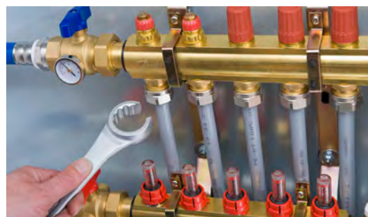
Fig. 4: Tighten compression fitting nut with a 30 mm open ended spanner.